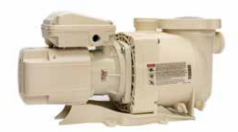
SuperFlo High Performance Pump